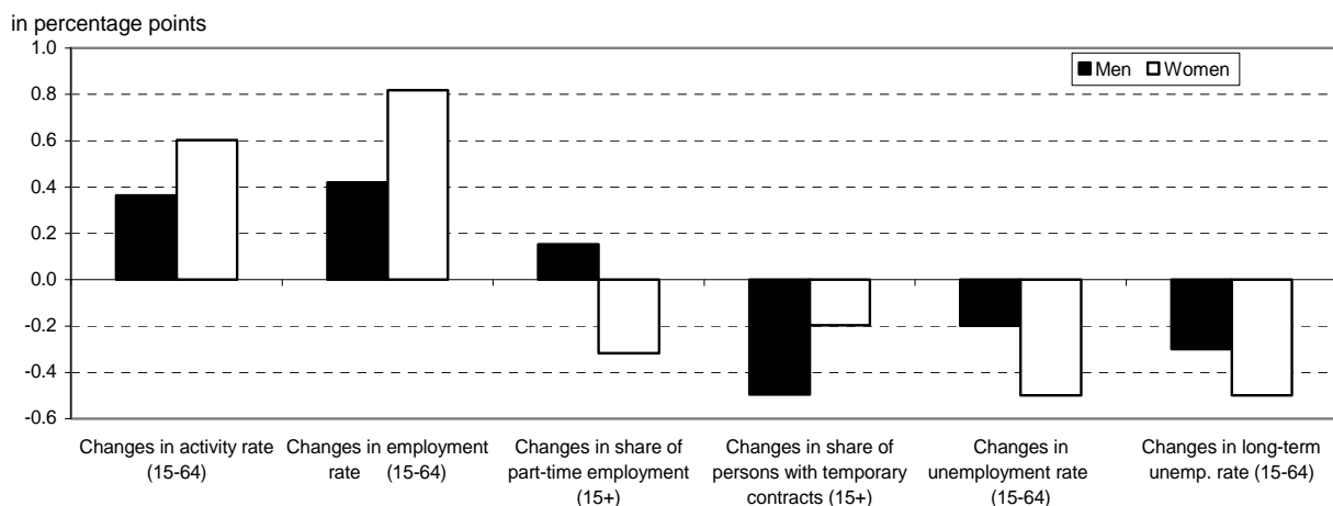
Chart 2: Changes in selected indicators for EU-27 from 2007Q2 to 2008Q2